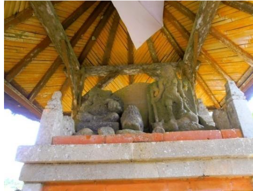
Picture 5: Archaeologist in Pura Natar Jemeng Desa Wisata Pinge

Another cultural potential possessed by Pinge Tourism Village is the “mebat” tradition (occurring on certain days when there is a celebration ceremony) carried out by men. Cooking the typical dishes of Pinge Village is also a tradition and cultural potential that can be explored. Some of the typical dishes owned by Pinge Tourism Village are pulungan, cake laklak, satay lilit, steamed sambal, and lawar typical of Pinge Village. In addition, the traditions of the community or farmers who walk carrying crops, the tradition of making canang or mejejaitan, beating and practicing dancing, painting, mebongbong (cockfighting practice), and the tradition of gotong royong every 15 days are also cultural potential done by society of Pinge Village.