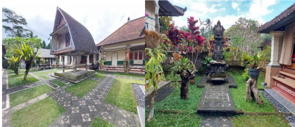
Gambar 8: Pinge Tourism Village Traditional Building

The arrangement of houses for the people of Pinge Tourism Village is based on the main village road. This holy place which is usually called sanggah is located on the side of the main road which is in accordance with the Tri Hita Karana philosophy, namely Parahyangan. Then Bale as the Pawongan area, and Kebun as the Palemahan area which is located in the backyard of residents' houses.