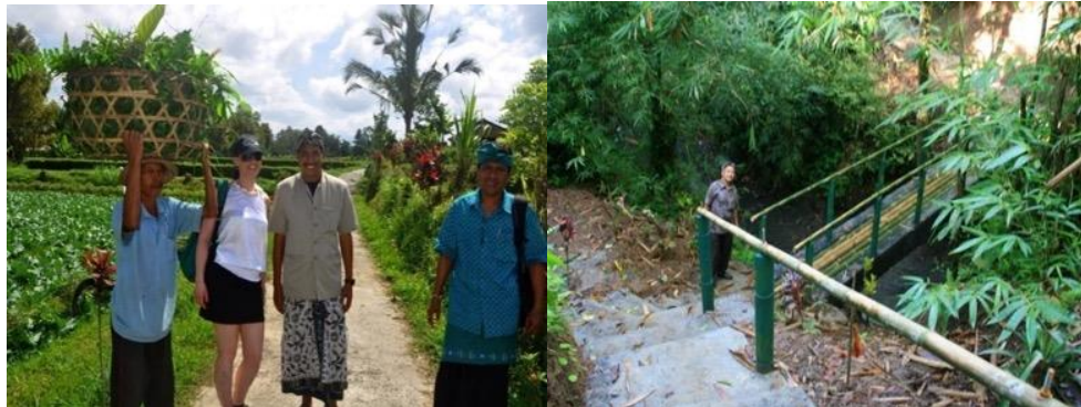
Gambar 2: Trekking Activities at Pinge Tourism Village

the village community's cooperation is the opening of a village route to Beji Temple for about 1 km with a road width of 1.5 m which will be used as a tracking and religious route. In addition, for the future plans, the village community will arrange the place around Beji Temple as a place for meditation and yoga.