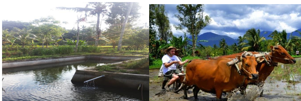
Picture 1: Fishing Ponds and Plowing Activities in the Subak Pacung area

One of the natural potentials of the Pinge Tourism Village besides its beautiful rural natural scenery, is Subak Pacung. Some activities that can be done around Subak Pacung rice fields are fishing in the available fishing ponds, plowing the fields, and walking around the rice fields by seeing the beautiful scenery. The right time to enjoy the natural beauty around Subak Pacung is from 7 am to 10 am.