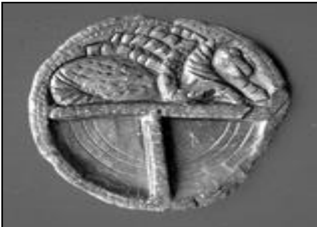
Plate 6: Winged hippo camp, body decorated with scales (Dar, 1984 & Francfort 1979)