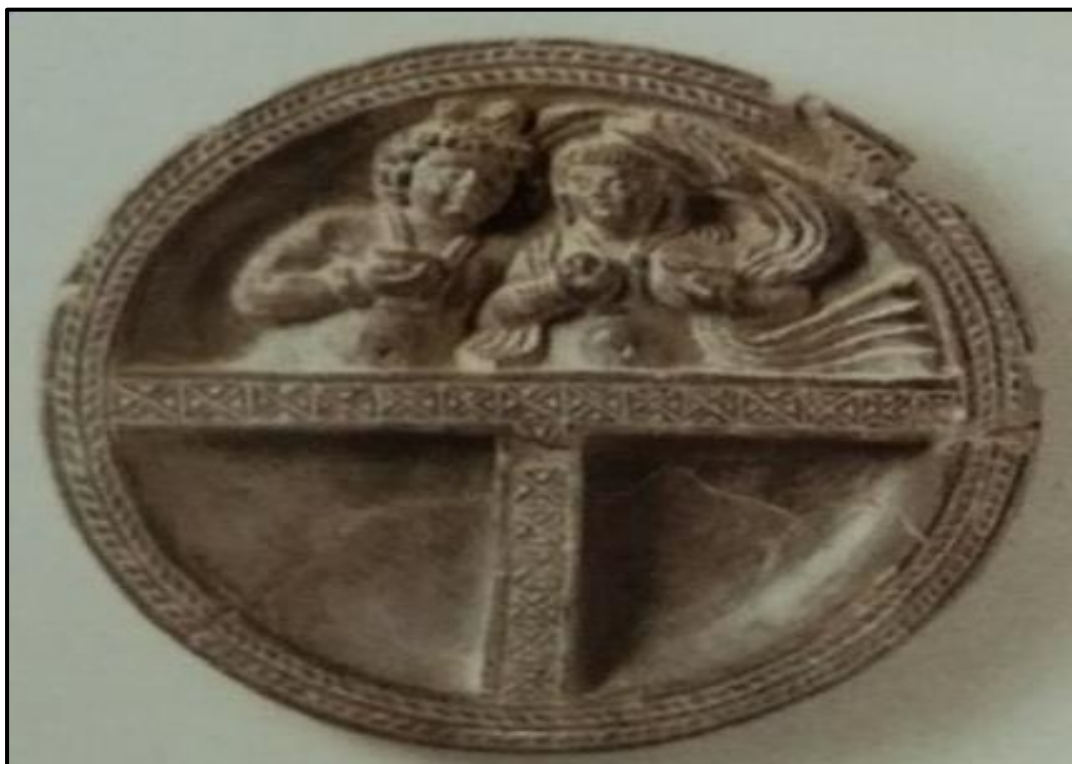
Plate 10: Showing male and female figures, period IV, Sirkap, (Dar,1984 & Francfort 1979)