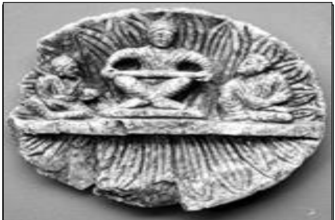
Plate 2: Stone Toilet Tray, Sirkap Taxila Indo-Scythian period (Dar, 1984 & Francfort 1979)