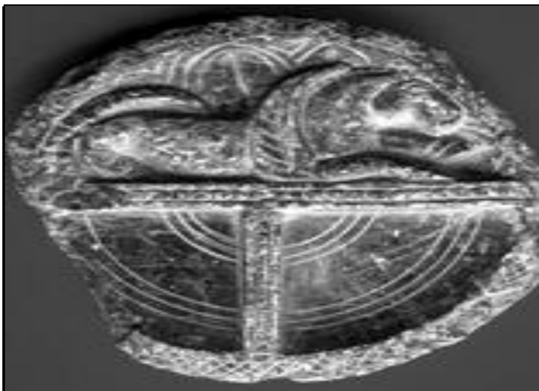
Plate 4: Winged hippo camp, Sirkap Indo-Scythian period (Dar, 1984 & Francfort 1979)