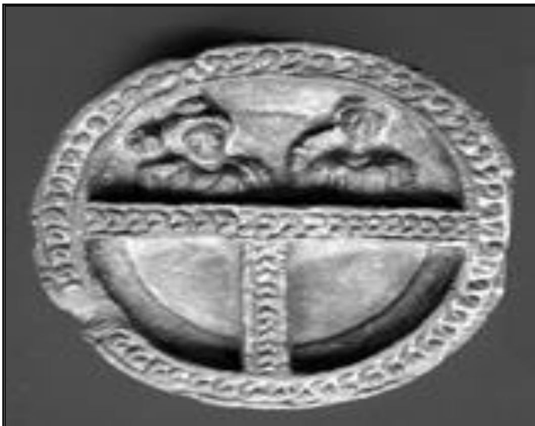
Plate 3: Stone Toilet Tray, Sirkap Indo-Scythian period (Dar, 1984 & Francfort 1979)