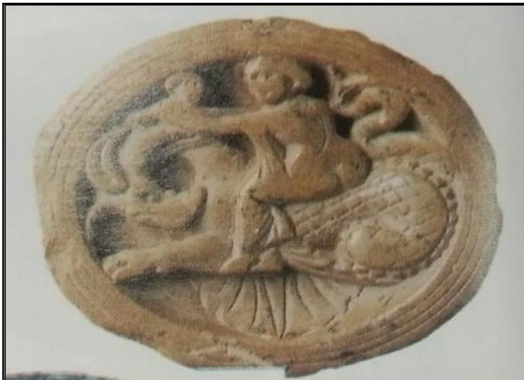
Plate 7: Toilet Tray (Mica Ceous Steatite), period IV, Sirkap, Dar, 1984 & Francfort 1979)