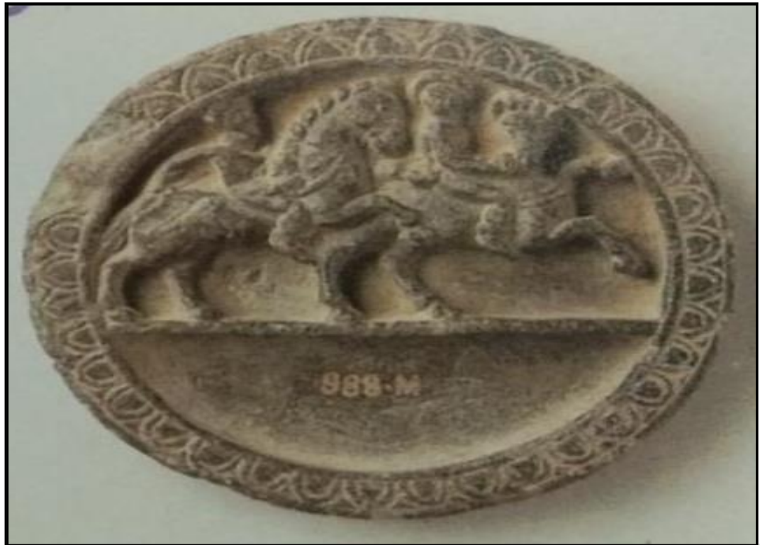
Plate 9: Stone Toilet Tray showing horses from period IV, Sirkap, (Dar,1984 & Francfort 1979)