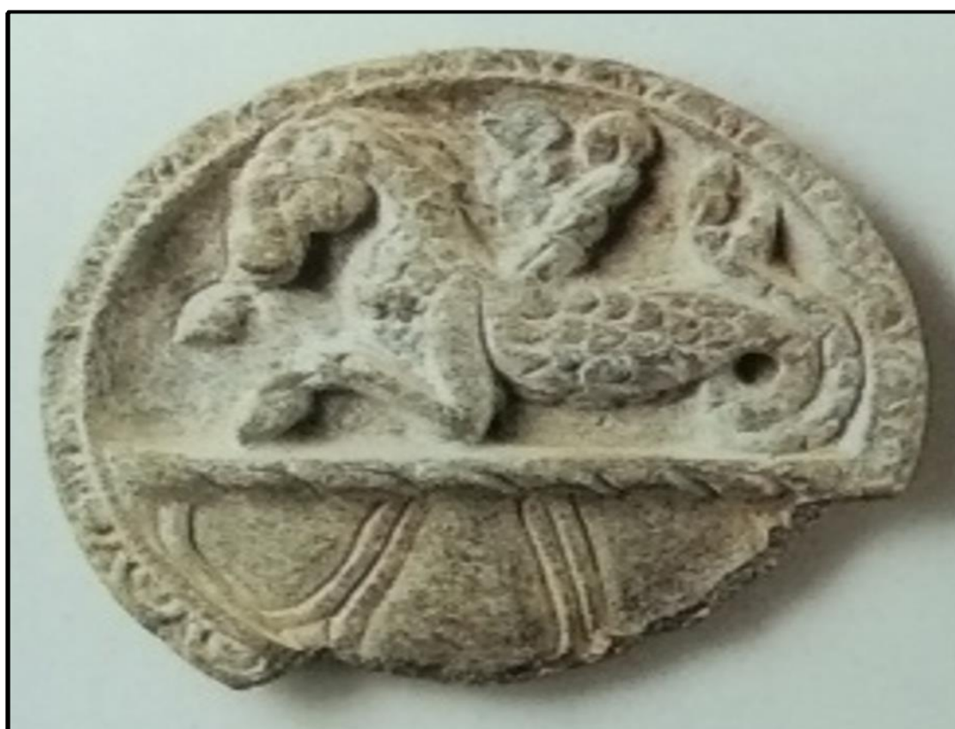
Plate 12: Showing a winged hippocamp, Sirkap City, (Dar, 1984 & Francfort 1979)