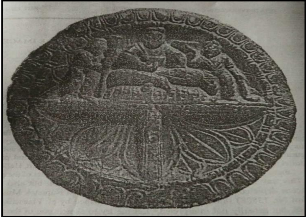
Plate 1: Stone Toilet Tray, Gandhara, with the Image of Indo-Scythian king (Ladislav, 2000, 138)