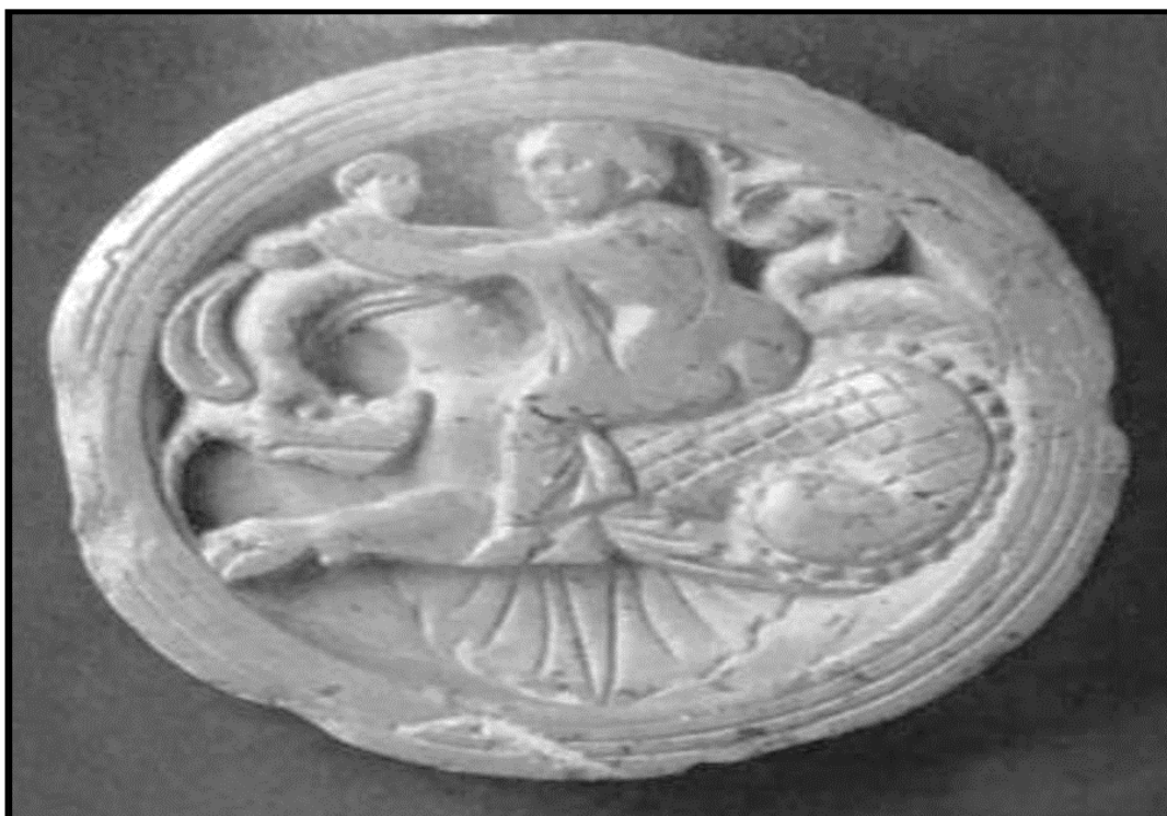
Plate 11: Semi-nude female with a child riding a hippocamp, (Dar,1984 & Francfort 1979)