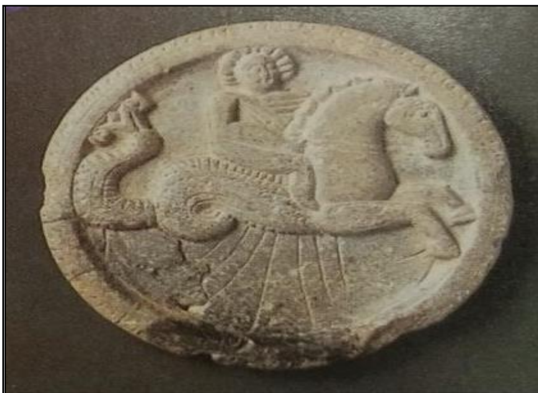
Plate 8: showing a hippo camp, from period IV, Sirkap, (Dar, 1984 & Francfort 1979)