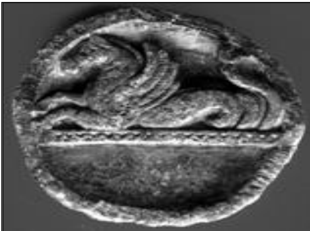
Plate 5: Winged hippo camp, Sirkap Indo-Scythian period (Dar, 1984 & Francfort 1979)