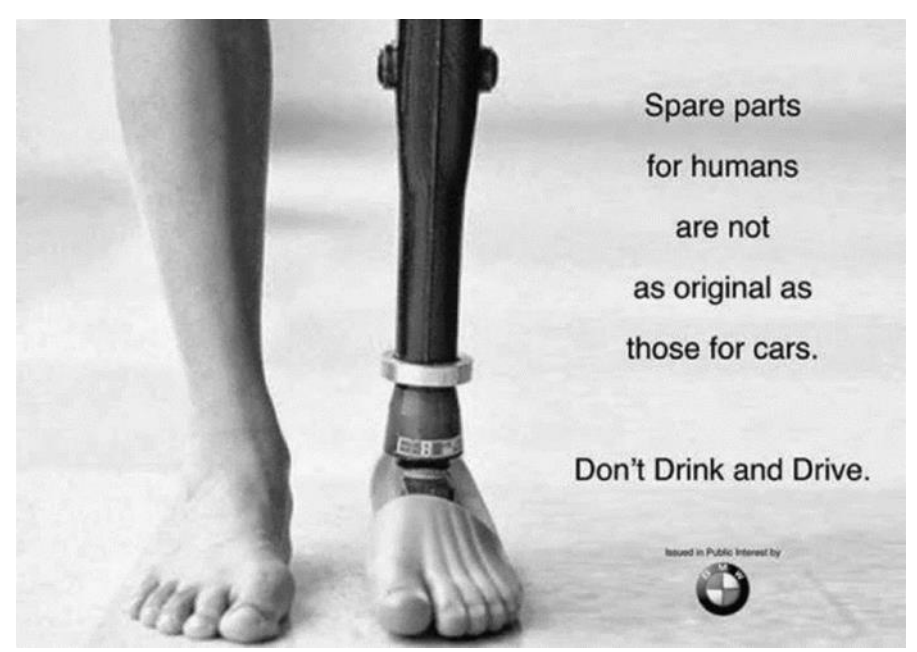
Figure 4 Pathos in Advertising - BMW Warns Against Drinking and Driving