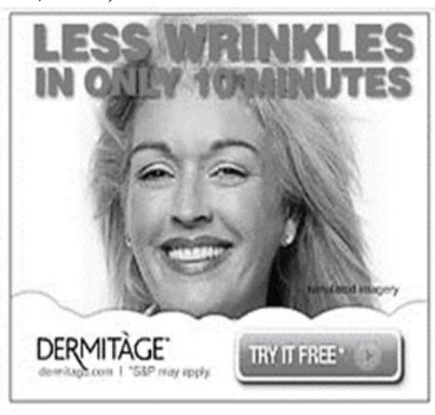
Figure 8 Deceitful Advertising Depicted through Dermitage Anti-Aging Cream