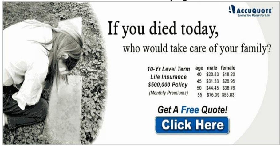
Figure 9 Emotional Manipulation Depicted in Insurance Ad

Emotive persuasion. This type of manipulative advertisements plays with the consumer's emotions by often inducing fear or threating with dangers while making promises of amazing results. This can be achieved both at conscious and unconscious levels. They often try to make business out of consumer's vulnerabilities by monetising products critical to their state of well-being, if required. They use manipulative linguistics, imagery, and visuals as tools to deceive and mislead consumers to influence buying behaviour.