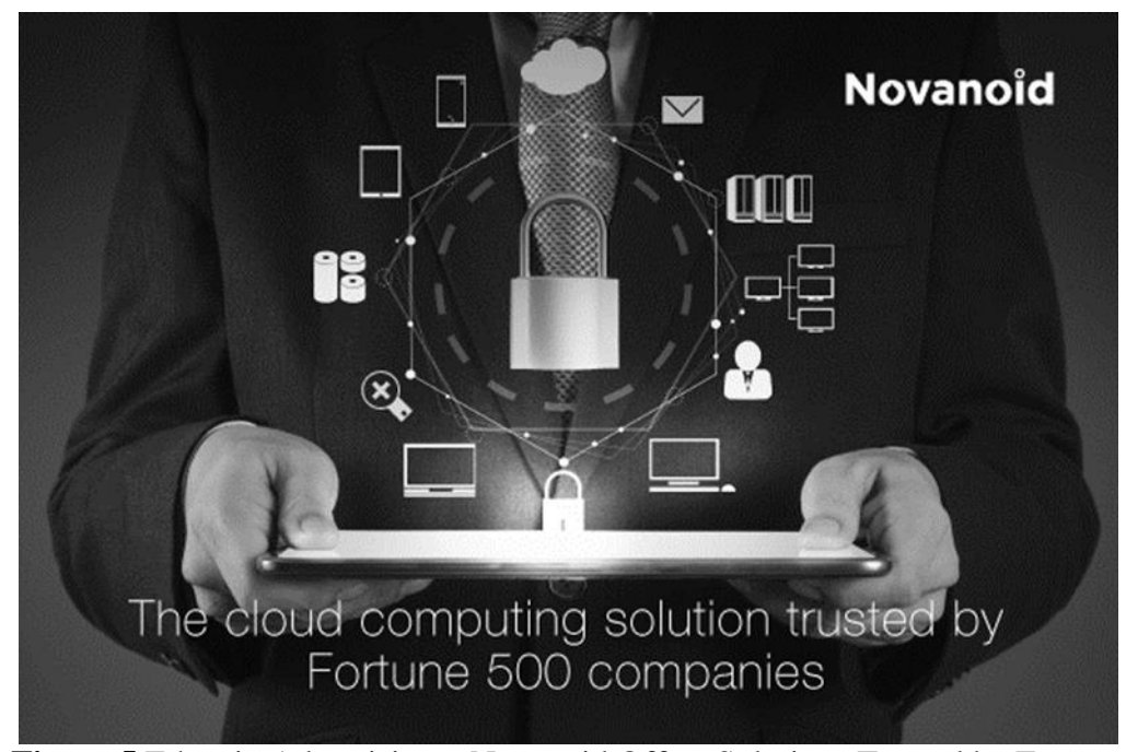
Figure 5 Ethos in Advertising – Novanoid Offers Solutions Trusted by Fortune 500 Companies