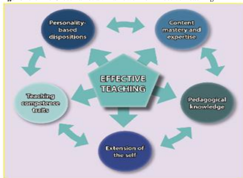
Figure 1.1: The Grossman et al. Framework of Effective Teaching

This method shows how various strategies communicate. However, it fails to cover the reach of the teachers' pedagogical methods and performance.