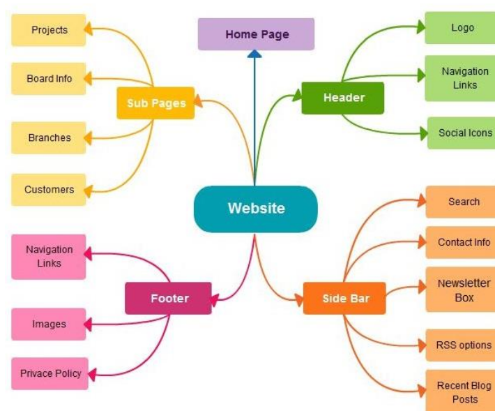
Figure 1. Creately for Education

learner. In little pre-literate societies, like searching and gathering bands, informal education became sizeable [8]. Younger youngster learned records and competencies, what they required to grasp regarding the each day lifestyles and exchange in their oldsters informally with the aid of imitating the older individuals of society. In these societies, the coaching of new contributors concerning the person roles changed into achieved informally, but in additional superior societies of industrial type needed quality and numerous formal systematic training that social academic institutions of new varieties slowly advanced, alongside the specialized role of instructor. Education supplements what families will train their kids reception required to perform within the superior digital system world. Education in its stylish type involving the instructions of Pupils internal socially created college premises grade by grade began to emerge with the spread of written fabric [9-11].