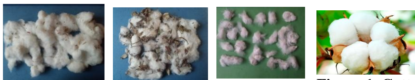
Figure 1. Cotton cases.

It is known that the cottonseed (box) consists of 3-5 parts (Figure 1 d). One piece of cotton hollow can contain 7 to 12 seeds. At present, cotton ginneries mainly treat cotton with the help of cleaning equipment - UCC cleaner.