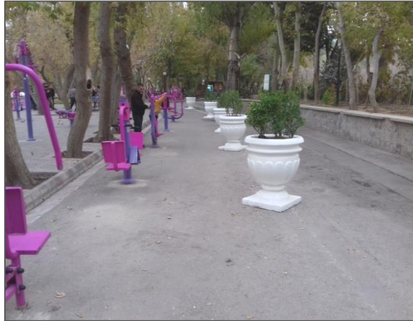
Figure 7. Developing a barrier in the performing of the social activities of the park users through placing barriers (Pot) in the sports space of the users