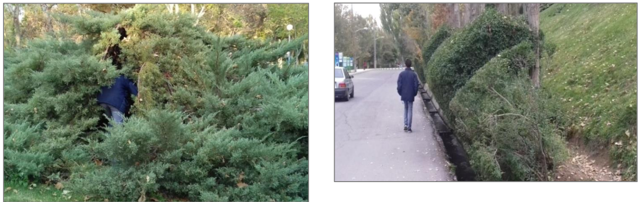
Figure 3. Using dense vegetation in the park