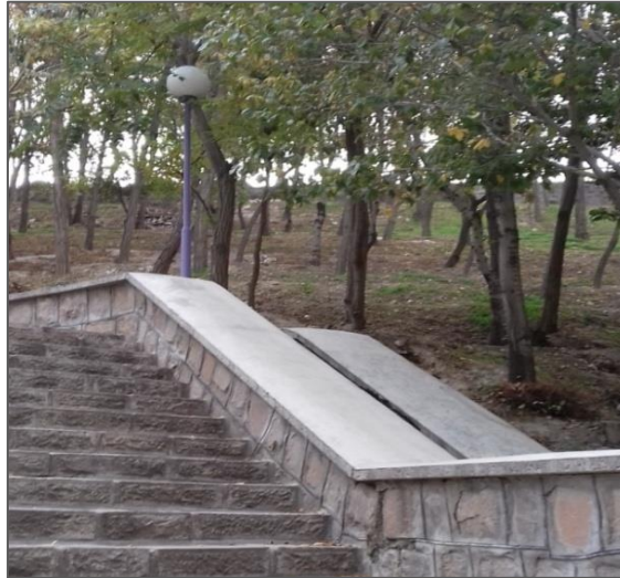
Figure 8. lack of observation of lighting and installing lights among the bunch of trees