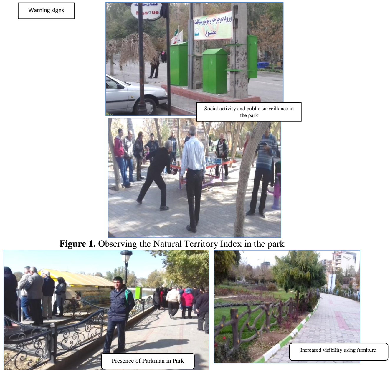
Figure 1. Observing the Natural Territory Index in the park