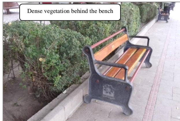
Figure 2. Violation of Natural Surveillance in the park