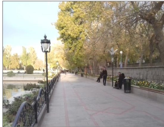
Figure 9. proper lighting around the pool