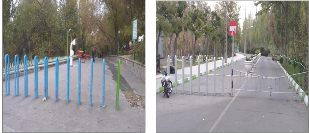
Figure 5. using fence and barriers to prevent the entrance of motorcycles in the park

inappropriate for the criminals due to the access control in these parts (Figure 5) as a result of which, the crime incidence rarely occur in this part of the park. However, to improve the security of the park users, it is required to provide the proper lightings in the dark pathways and the entrance and exit parts of the park.