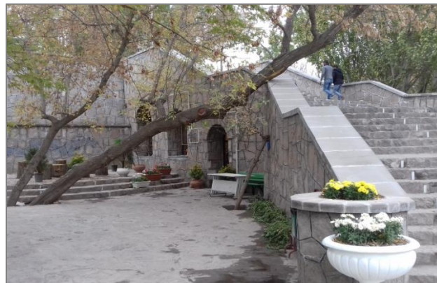
Figure 4. Observing Natural Surveillance and using hidden and blind space as Parkmen' Office