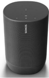
Figure 2 Sonos with Sonos Move (S, 2019)

“Sonos”, a leader in home audio which used to control the smart audio devices. Sonos is founded by John MacFarlane in 2002 and it keep improving until today. It also supports for all the major stream services (Kozuch, 2020).