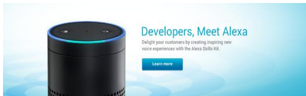
Figure 1 Alexa with Echo device (Isbitski, 2015)

According to the research, there are some of the famous existed product which act nearly similar to this proposed system. They are Alexa and Sonos.