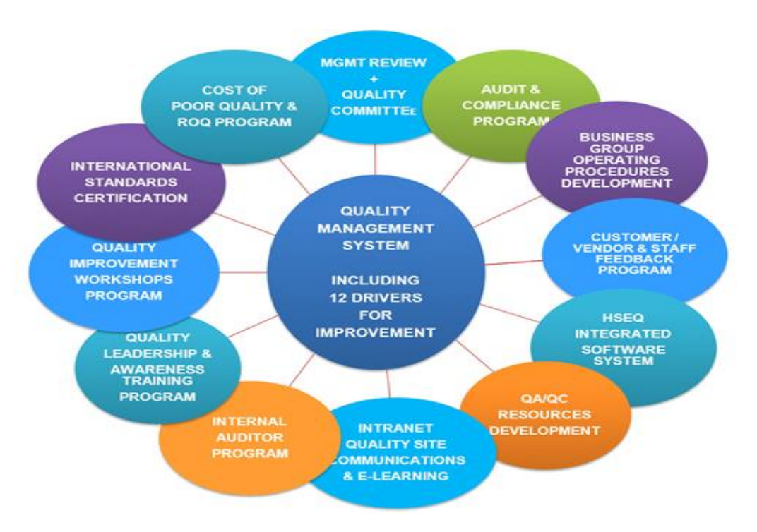
Figure 2. The Quality Assurance System of Higher Education

With the conceptual foundation of a solid quality assurance system, then reinforced by the 5 (five) aspects of quality culture above, it is hoped that it can become a strong foundation for building academic and non-academic quality as well as higher education competitiveness in the global era. The relationship between various components to build a culture of higher education quality in this discussion can be described as follows: