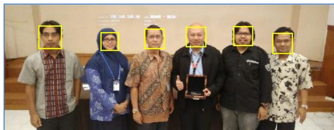
Figure 1.3 taking pictures in groups

In the picture above is the system of testing the system using images perpendicular to the camera, from the test results it can be concluded that the computer vision algorithm can detect areas of the face with the concept of direct photos