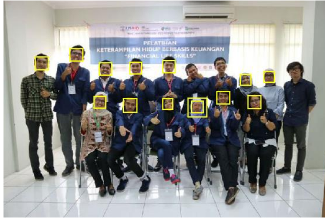
Figure 1.4 system testing process with the number of groups at a various distance