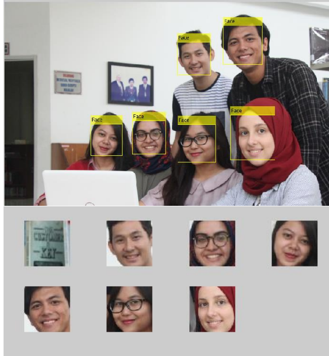
Figure 1.7 Detection system with face tilted towards the camera

in Figure 1.7 is a face detection system testing system with a distance from the camera, in the test the system can't recognize the face area because this computer vision algorithm can't recognize a face that isn't perpendicular to the camera and a great distance scanning process on the image will process twice until the face pixel area is detected.