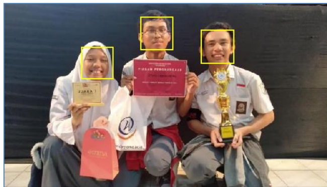
Figure 1.2 Detection system towards the camera

In this system testing method using data in the form of images taken randomly by using a number of pixels and different image distances form face detection method uses open CV.