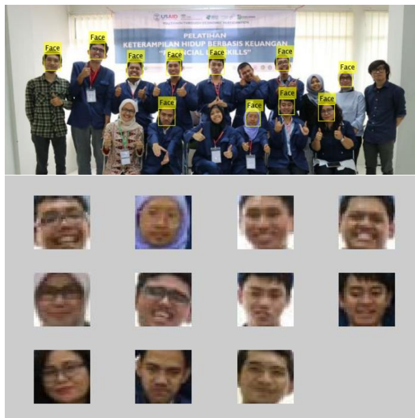
Figure 1.5 detection test with open Computer vision

In Figure 1.5 is the process of testing the system with a greater number of people over a distance, in this method computer vision algorithm can only detect faces of people who are upright to the camera facing the image, there is data on the undetected face area because it is not perpendicular in the direction of the camera.