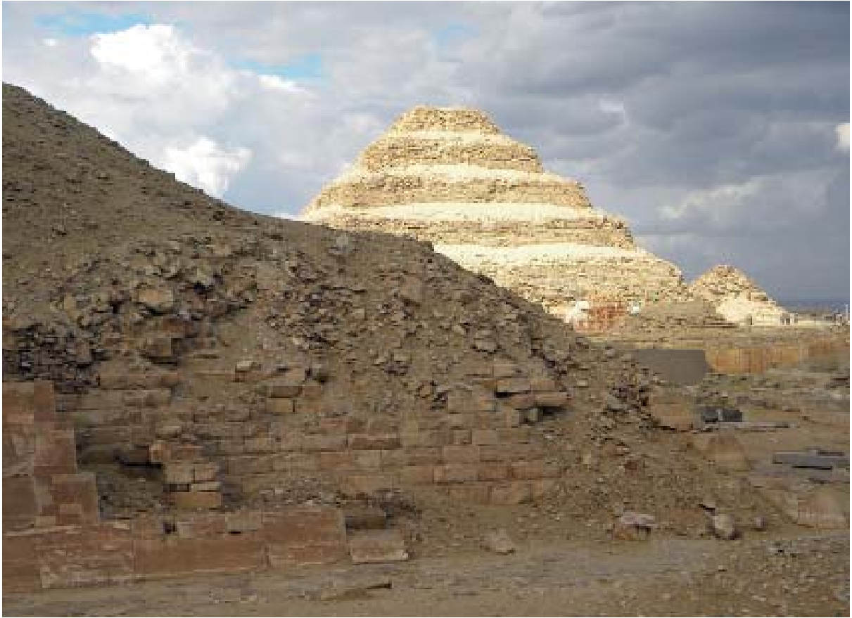
Figure 4. A photograph taken from the area immediately south of the Unas pyramid, visible in the foreground. The 'Saqqara axis' connecting Unas' diagonal with the south-east corners of the Step (middle) and Userkaf (background) pyramids can still be clearly perceived, in spite of the bad state of Unas' and Userkaf's monuments.