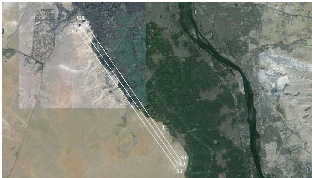
Figure 2. A satellite image of the Memphite area. Lines connecting the Giza pyramids of Khufu (G1), Khafre (G2) and Menkaure (G3) respectively with the Userkaf (S1), Djoser (S2) and Unas (S3) pyramids in Saqqara are shown. Given the pre-existing (of course casual) G2-S2 line, the G1-S1 line may have inspired the choice of Userkaf's building sites; it actually crosses Userkaf's sun temple located in Abu Gorab (denoted by T). After more than one hundred years, Unas added his pyramid in accordance with the pre-existing topography (G3-S3 line). This image is shown here only as a visual aid to identify the 'Saqqara-Giza' analogy; the connection was indeed (and partially still is) clearly perceptible on the ground, because the length of the lines is about 14.5 kilometers and therefore they allow direct inter-visibility. See text for full details. Diagram by the author.

The first to notice a Saqqara-Giza analogy was Goedicke (2001), who observed that an unobstructed line of sight connects the Userkaf pyramid with that of Khufu, crossing over the Userkaf's sun temple in Abu Gorab (figure 2). Today this temple has almost been erased, but at that time it was surmounted by a huge