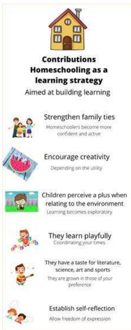
Figure 3. Contributions of homeschooling