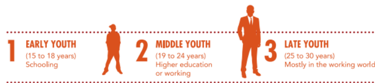
Figure 1.3 The Group of Youth

The Malaysian Youth Policy (2015) is based on three (3) main goals aimed to ease the implementation of youth's mechanism and highlighting the potential of youth in conjunction with the Federal and National Constitution. Nowadays, competitive global environment has demanded the youth to be creative, futuristic and be on the track of the latest technology developments. Thus, this social transformation has profoundly influenced the thinking and the lifestyle of today's youth. This scenario requires a different approach to determine in the planning of youth development. In this globalization era, Malaysian youth need to be well prepared mentally and physically as they will face many challenges. Unfortunately, not well managed will affect social problems thus impede youth development. As such, Malaysian Youth Policy (2015) had identified major key points that will be facing by the youth. Somehow, this body also responsible in ensuring the policies formulated will meet current and future needs and also demands. This new media somehow has become indispensable part of everyday life. It is not surprising more young people nowadays use this medium because of it easily access and ease the lifestyle. Youth also included teenagers and college students. Meanwhile, demonstration is the ability for the users in choosing from a wide selection (Norhabiba & Ragil Putri, 2018).