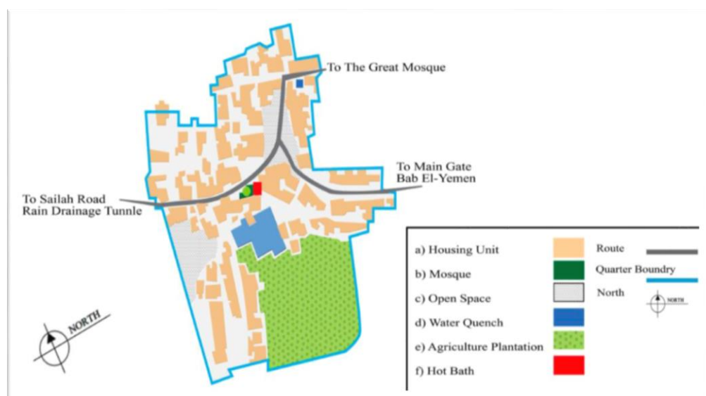
Fig. 2. The prototype of quarter component