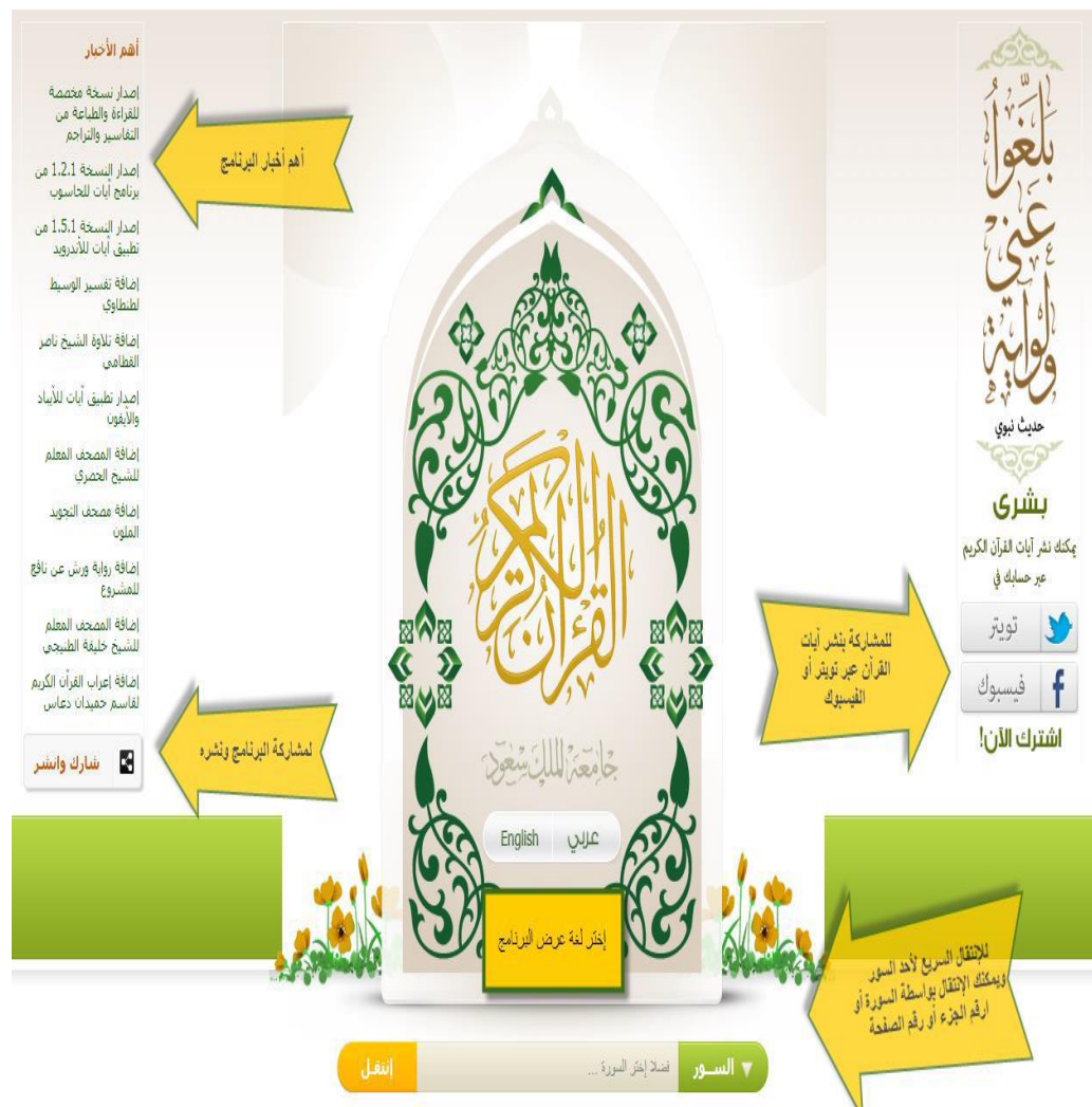
Figure 1: The program interface

We can benefit from the website through the internet directly, or after installing it on the device and using it without an internet connection, or downloading the application and displaying some of the surrats. The website aims at connecting the Muslim nation with reliable interpretations, occupy times and their connection to Almighty Allah's Book, and to learn the Arabic language through listening.