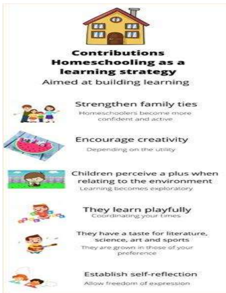
Figure 3. Contributions of homeschooling