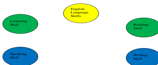
(Fig.1: Four skills to acquire the knowledge of English Language)