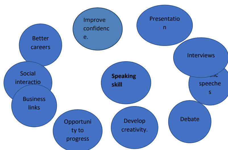
(Fig.3: The Importance of Speaking Skills)

Furthermore, this communicative skill is required to settle down well in the careers. People are assessed at the time of interview through their speaking skill. If the person conveys his/ her ideas effectively to the interviewers, he / she is considered a talented person. Many applicants are selected at the time of interview due to their speaking skill. Additionally, the person having impressive communicative ability, can get the importance of the heads, interviewers, boss, audience and so on. Words have magical power to catch the attention of the people. The good speaker casts a spell over audience with the magic of his/ her words. Sometimes, the speaker with the beauty of his/ her words keeps the audience engaged in such a way that they forget their surroundings and are fully lost to the speech or talk that is being carried out. Briefly, it may be said that speaking skill performs crucial task and the way, style, and way of talking of speaker also count how he/she delivers his/her ideas to others.