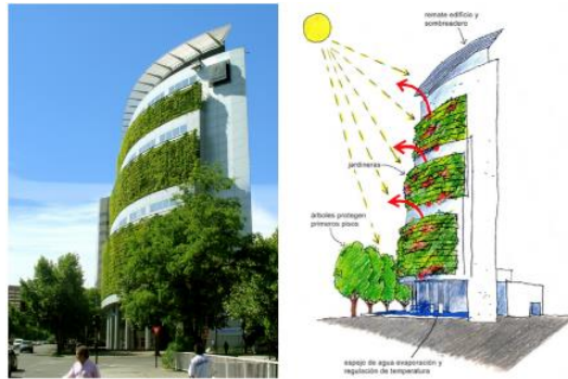
Figure 2:Chilean Consortia Building, Chile

In recent days, a new approach has been common in incorporating plants into buildings and the main focus is on the biologically vivid building incorporation of nature into the layer of spaces [32]. The principle further considers local lighting and ventilation environment in order to cooler and preserving the internal atmosphere by using vegetation, thus limiting the use of mechanical HVAC system and reducing the energy consumption. This theory further leads to reducing external heat losses [18,25]. The following cases are known for studying the newest types of practices, including planting indoors and outside, depending on their experiences and values.