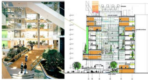
Figure 3: The Genzyme Center, US