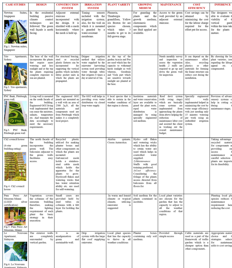
Figure 3: Case study green walls with respect to its design, construction system, irrigation, system, plant variety, growing medium, maintenance and cost efficiency

Commented [SPD3]: Review Comment-5: Single table for comparative analysis of all the factors associated with the case studies