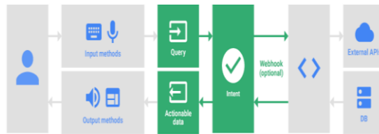
Fig 1: System Architecture of Virtual Digital Assistant

In the first section, the information is accrued in the structure of speech and saved as an entry for the subsequent segment for processing. In the second phase, the entered voice is consistently processed and transformed to textual content the use of Speech-To-Text. In the subsequent section the transformed textual content is analyzed and processed the usage of Python Script to pick out the response to be taken in opposition to the command. Finally, as soon as the response is identified, voice output is generated from easy textual content to speech conversion by the usage of Text-To-Speech. The basic system architecture of the virtual digital assistant is shown in figure 1.