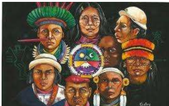
Figure 1. Ethnic multidiversity of Ecuador

Recent years, things have changed, but the image of a country of whites or white -mixed raceis still quite ingrained. For more than a century the idea was cultivated that the Ecuadorian nation was uniform or, in any case, it should become so, it is not possible to deny the presence of indigenous people and blacks, it was thought that everyone should try to approach the stereotype of the Ecuadorian and integrate into the dominant society. For this, it has sought to standardize the customs, language and forms of social organization of all Ecuadorians, something that is not possible because each region has its habits, customs, food (Álvarez, 2017). Indigenous practices and beliefs have been considered "wild," "primitive," or purely folkloric; the languages 13 of the native peoples have been considered "uneducated" and it has been tried to eliminate them. Blacks have been treated with racism, as upstarts and inferiors; but interculturality and plurinationality have been strengthened with SumakKawsay (Rodríguez, 2017).