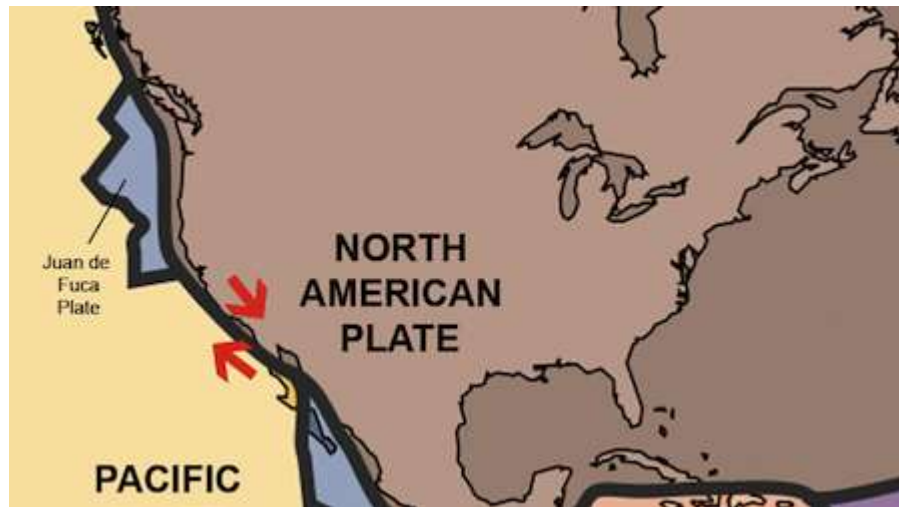
Figure 3 Transform Plate Boundary St. Andreas Fault Line.[24]