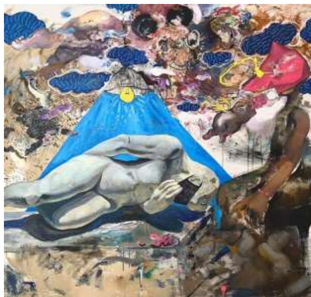
The Pandemic, 2020, Senan Hussein, Iraq