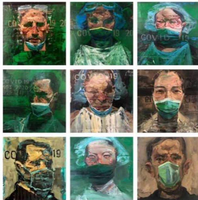
Sad faces, 2020, SerwanBaran, Iraq