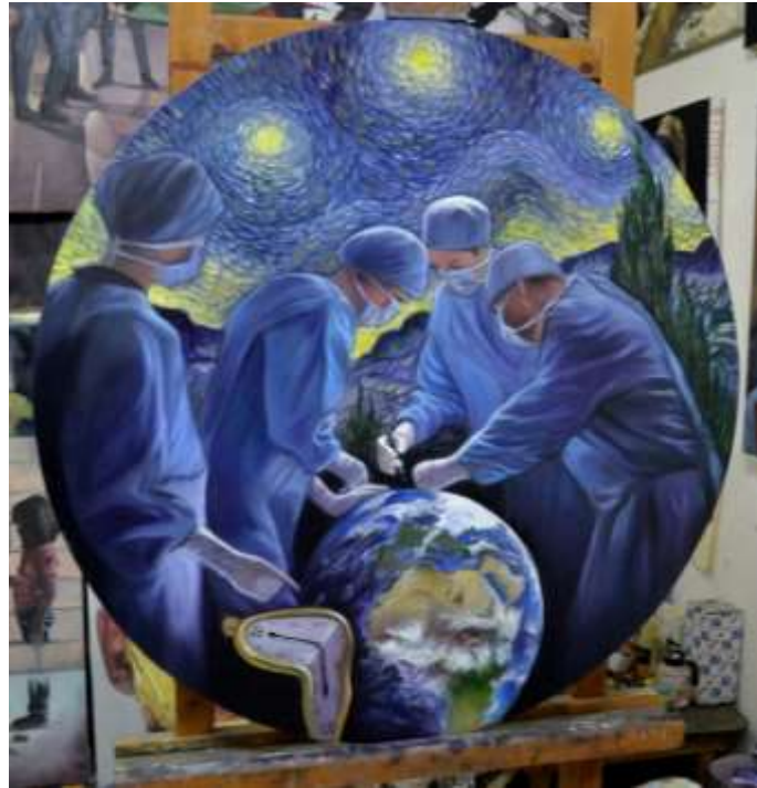
Tired Angels, 2020, Ishaq Bin Salah, Algeria