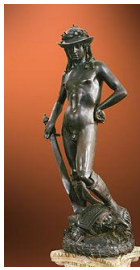
Figure (1) The statue of David by the sculptor Donatello