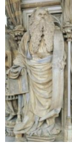
Figure (7) Moses by the sculptor Klaus Slaughter