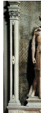
Title: Saint George. Sculptor: Donatello. Material: bronze.