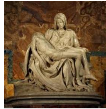
Sample No. (3)

Title: Statue of David. Sculptor: Donatello Material: bronze. Date: 1430 - 1432 AD. Location: Bargello National Museum, Florence. Dimensions: Height 158 cm.