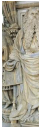
Title: Statue of Moses. Sculptor: Klaus Slaughter.