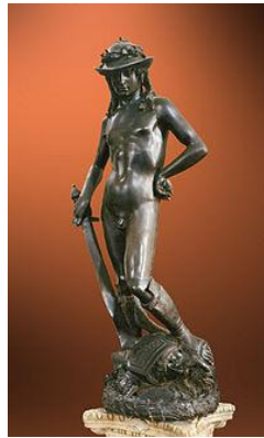
Sample No. (2)

The statue of Moses, which is part of a large sculptural work, which is the well of Moses and in the monastery of Chanmoul in Dijon in France, which represents the sensory means to show the beauty of the previous ideas of the sculptural work, and it consists of many religious figures that include a group of prophets in a hexagonal