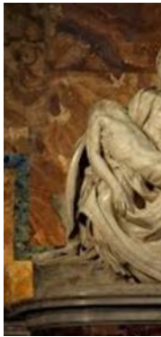
Title: The Mercy Sculpture. Sculptor: Michelangelo. Material: marble. Date: 1497 AD. Location: The

Donatello. Material: bronze. Date: 1430 - 1432 AD. Location: Bargello National Museum, Florence. Dimensions: Height 158 cm.