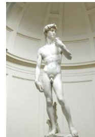
Figure (4) Statue of David - the sculptor Michelangelo