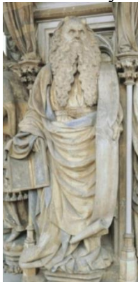
Sample No. (1)

Title: Statue of Moses. Beekeeper: Klaus Slaughter Material: limestone. Date: 1395 - 1406 AD. Location: Federe Chanmoul, Dijon, France. Dimensions: Approximately normal size.