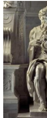
Title: Statue of Moses. Sculptor: Michelangelo. Material: marble. Date: 1505 AD. Location: Altar of