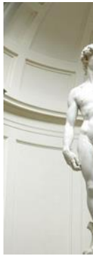
Title: Statue of David. Sculptor: Michelangelo. Material: marble. Date: 1504 AD.