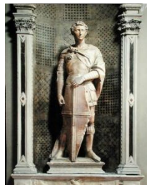
Figure (2) The statue of Saint George by the sculptor Donatello