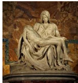
Figure (3) Statue of Mercy by the sculptor Michelangelo