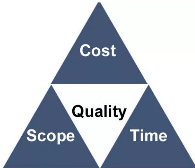
Figure 2. The first variation of the triple restriction according to Atkinson (1999)

According to PRINCE2, a product is of higher quality if it has a greater number of functional functions, and directly relates the deliverables as qualities.