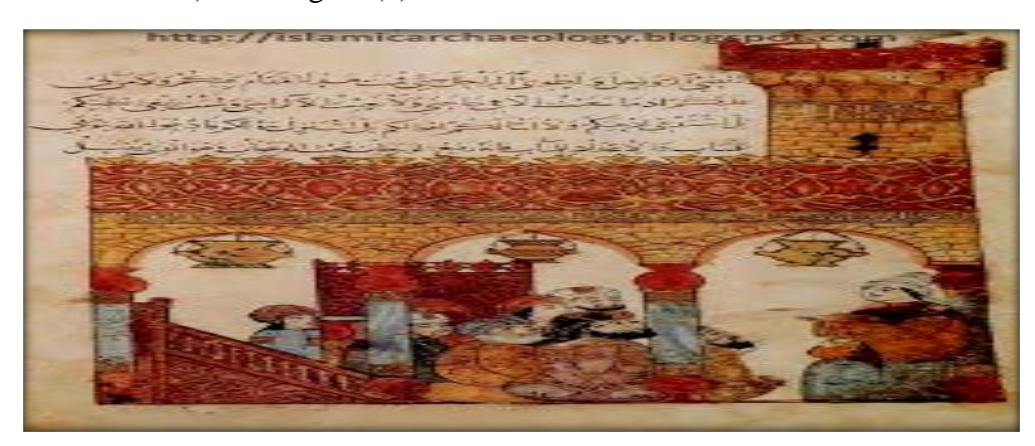
Figure No. (4) Abu Zayd in one of the mosques in Morocco asking for charity from those sitting in, a copy of the sixteenth shrine, Baghdad, 634 AH - 1237 AD, preserved in the National Library, Paris

The artist (Al-Wasiti) mastered the drawing of buildings, and what he drew was a document of the style of architecture that was common in the outskirts of the Islamic world. He was interested in photographing people, distinguished between men and women, the old man, the young man, the prince and the poor, and he tried to give fixed features to invalidate the shrines, and photograph the human crowds) as in Figure (4)