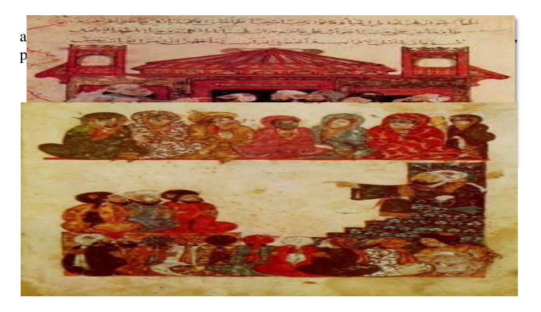
Figure. (3) Abu Zayd delivers a speech in the city of Al-Rayyi and exposes the prince and forbids him from injustice. A copy of the twenty-first shrine 634 AH - 1237 AD The National Library Paris

The artist (Al-Wasiti) mastered the drawing of buildings, and what he drew was a document of the style of architecture that was common in the outskirts of the Islamic world. He was interested in photographing people, distinguished between men and women, the old man, the young man, the prince and the poor, and he tried to give fixed features to invalidate the shrines, and photograph the human crowds) as in Figure (4)