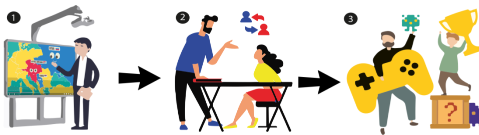
Figure 3. Stages of an interactive class

It is necessary to identify the needs of the students when planning the classes, the proposal that arises to achieve interactivity is to adapt traditionalism with ICT, maintaining its essence of being an expository method, and later reinforce the class with gamification that is based on multimedia content. Figure 3 shows the stages of an interactive class combining methodologies.